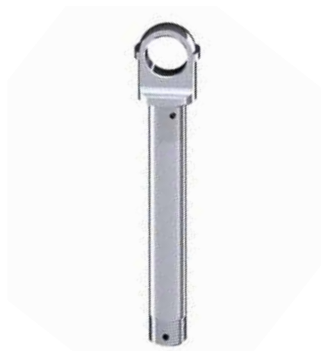
Custom Pin Fastener High strength and toughness Corrosion resistance