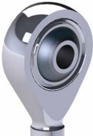
Self-Lubricating Rod End INVINSYS® patented liner system Extremely long life