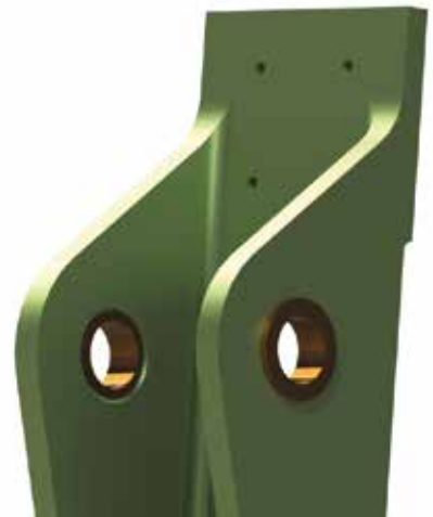
Custom Machined Part Light weight alloy Corrosion resistant coating