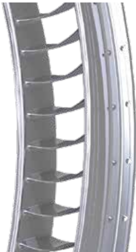
Stator Segment Additive manufacturing process Prototyping and production

For more information, contact the nearest sales office (see back page).