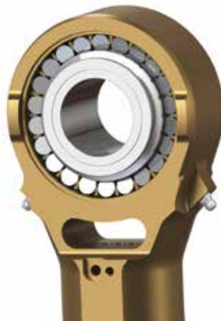
Rolling Element Rod End Bearing Heavy load capacity Precise low friction motion