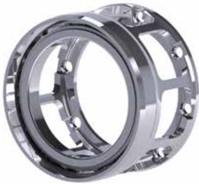
Cylindrical Roller Bearing Flexure cage outer ring High speed vibration control

We design and manufacture solutions for critical applications on everything from small business jets to wide body commercial airliners, from light turbine helicopters to heavy lift rotorcraft, and from space launch vehicles to satellites. Listed below are some of the many applications where our products are found. Contact sales to learn more.