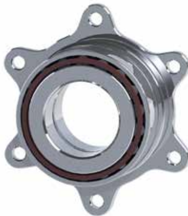
Hybrid Tapered Roller Bearing Duplex design with ceramic rollers High reliability