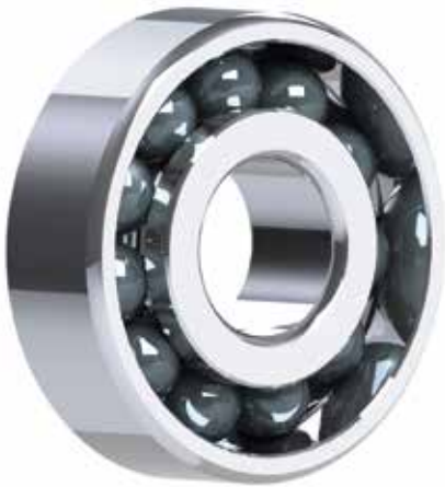
Angular Contact Ball Bearing High temperature alloy Silicon nitride balls