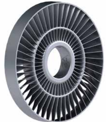
Blisk Aero Engine Component High temperature alloy Tightly toleranced machining